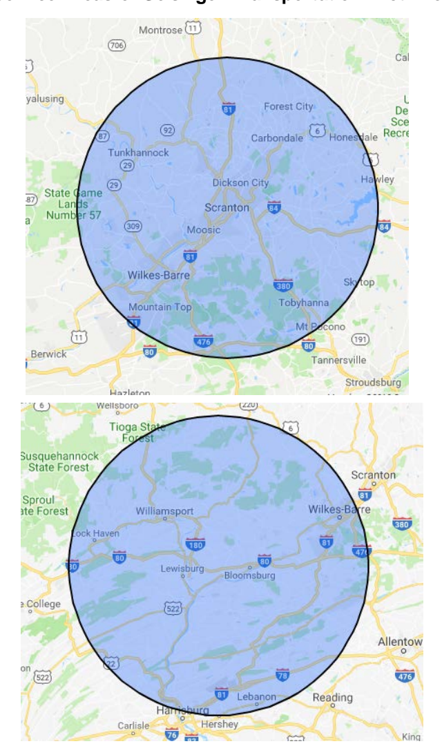
Figure 1: Service Areas of Geisinger Transportation Pilot Program

The rural pilot program service area covers portions of 10 counties and is based on mileage from Geisinger medical facilities. To participate in the pilot program consumers must reside within a 25-mile radius of Scranton or a 50-mile radius of Danville. Figure 1 shows the two service areas.